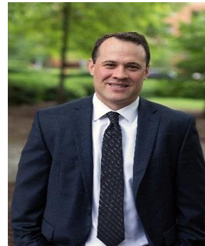
Donny Burke Foundation/UAB Advisor