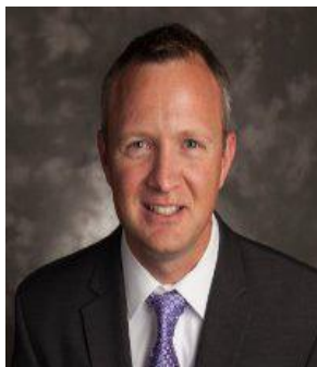
Troy Ogden Program Committee