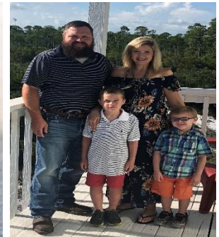
Drew Hall Community Affairs