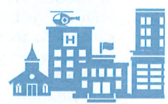
Can happen anywhere

An active shooter is an individual engaged in attempting to kill people in a confined space or populated area. Active shooters typically use firearms and have no pattern to their selection of victims.