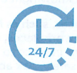
Can happen anytime